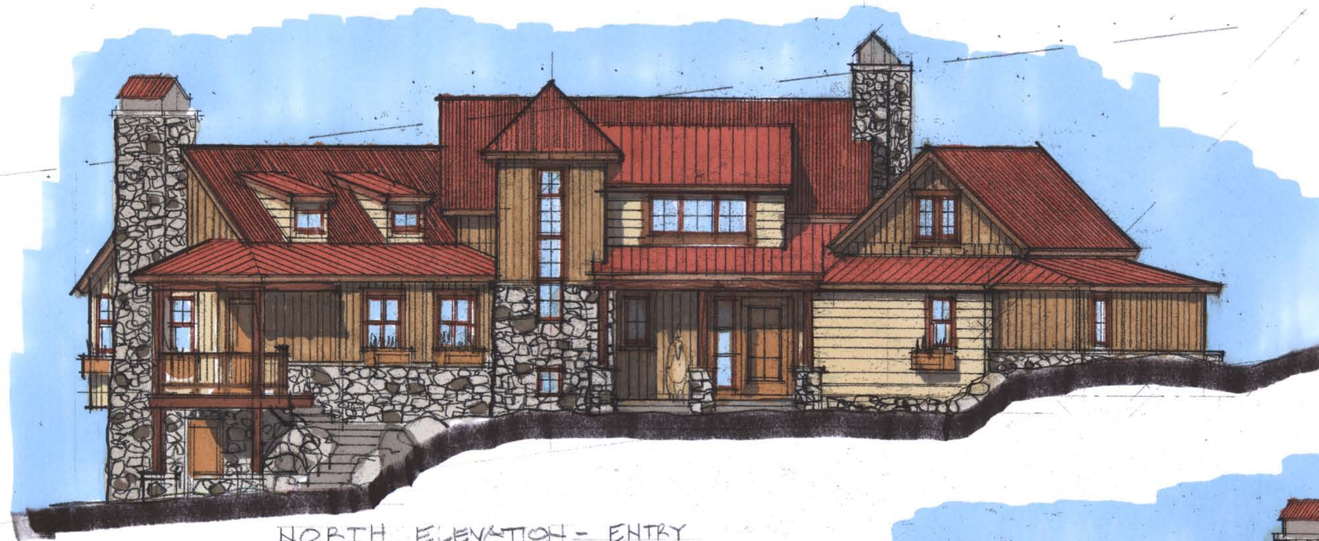
NORTH ELEVATION - ENTRY