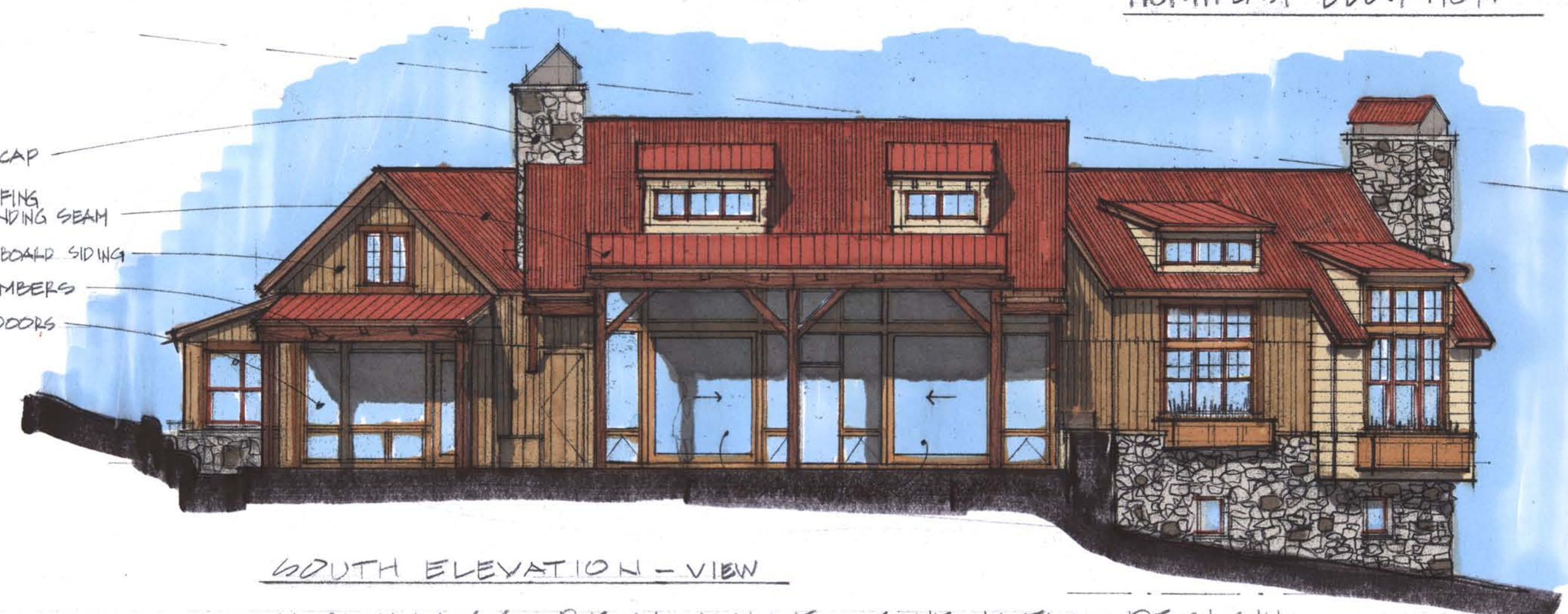
SOUTH ELEVATION - VIEW